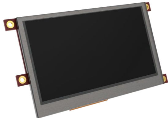
The uLCD-43-PT Display Module