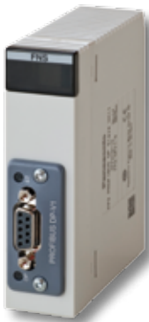
Slave units for PROFIBUS DP FP2-DPV1-S FPG-DPV1-S