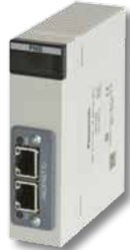
Slave units for PROFINET IO FP2-PRT-S FPG-PRT-S