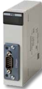
Slave units for CANopen FP2-CAN-S FPG-CAN-S