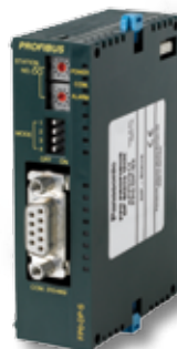
Slave unit for PROFIBUS DP (FP0/FP0R expansion unit also compatible with FP-X) FP0-DPS2