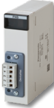
Slave units for DeviceNet FP2-DEV-S FPG-DEV-S