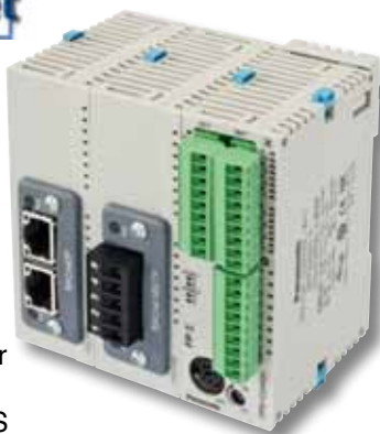
Slave units for BACnet FPG-BACIP-S FPG-BACMSTP-S