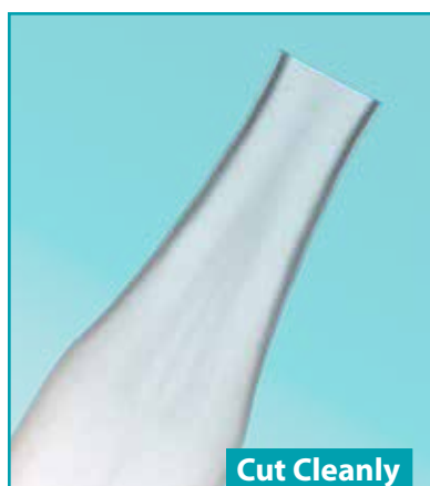
Cut Cleanly Scissor