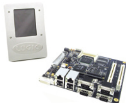
Zoom™ ColdFire Development Kit (CDK) & Display Kit

Fire Engine Advantage: Less time, less cost, less risk ... More Innovation