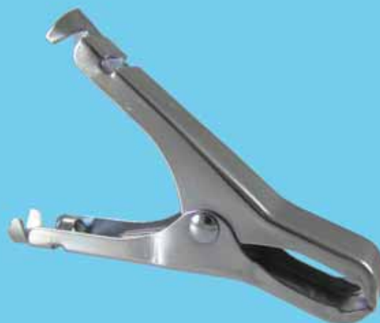
Small Charger Clip, Steel, Zinc Plated, 50 Amp