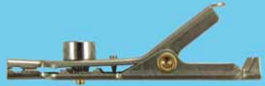
Telecom Clip, Bed of Nails and Single Spike Combo -Glove Style