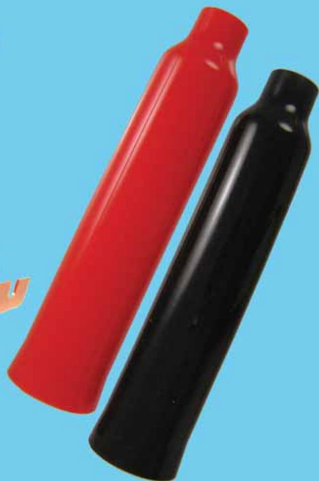
Insulator for the 501849 Series, {2 Req'd per clip}