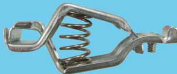
Small Heavy-Duty Clip, Steel, 25 Amp