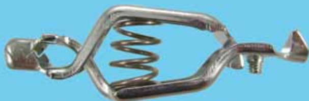
Auto Clip, Steel, 40 Amp