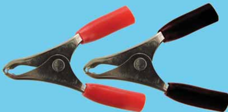
Petite Plier-Type Clip, Steel, 15 Amp