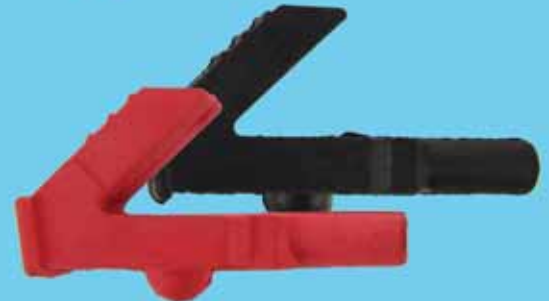
Insulator, Glove Style for the 501792 Series