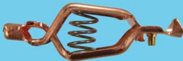
Auto Clip, Solid Copper, 75 Amp