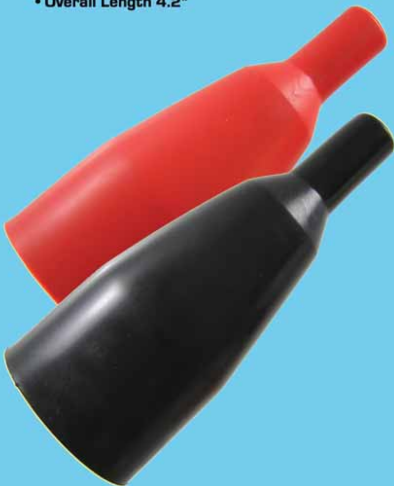
Insulator for 501790 Series