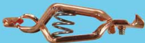
General Purpose Test Clip, Solid Copper, 40 Amp