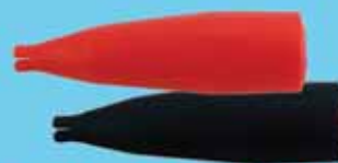
Insulator for 502008 Series