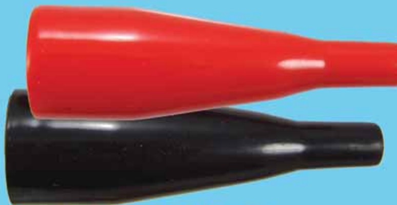
Insulator for 501997 Series