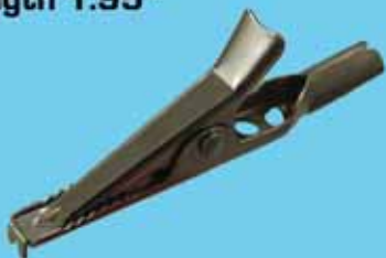
Alligator Clip, Steel, Fang Tooth with Barrel