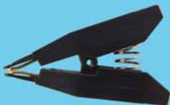
Insulated Kelvin Clip, 10 Amp