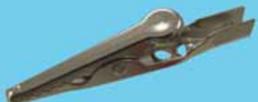
Alligator Clip, Steel with U-Shaped Tail, 10 Amp