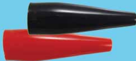
Insulator for 501994 Series