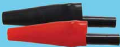
Alligator Clip, Steel Insulated, 10 Amp