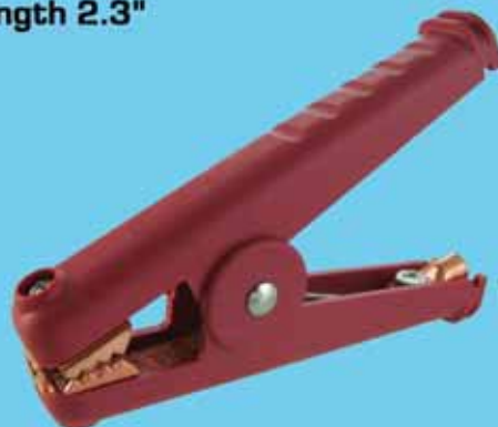
Fully Insulated Heavy Duty Clamp with Serrated Copper Teeth, 500 Amp