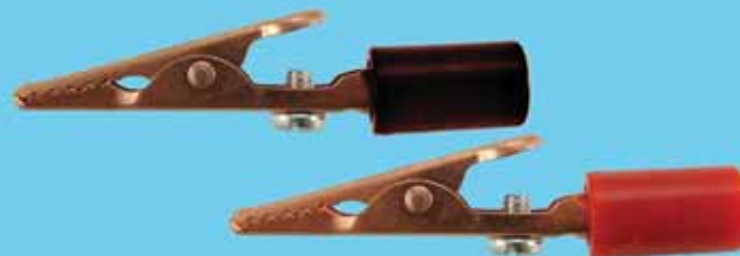
Alligator Clip, Solid Copper, with Barrel, Screw & Handle, 10 Amp