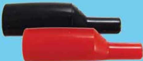
Insulator for 501784 & 501785 Series