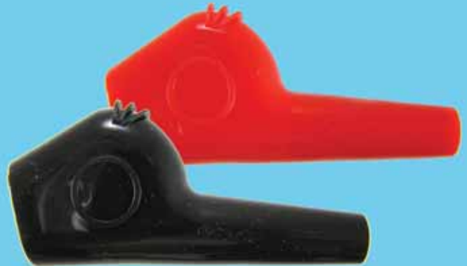
Insulator, Mitten Style for the 501791 Series