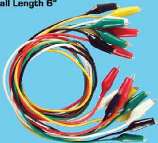
Multi-Color Insulated Lead Set