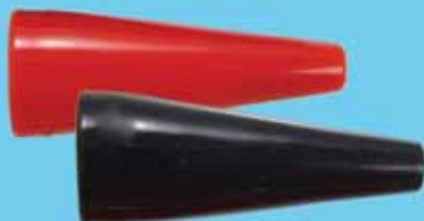
Insulator for 501995 Series