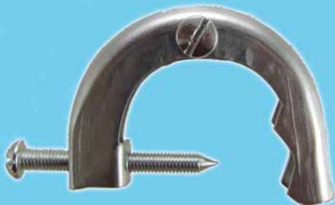
Grounding Clamp, Steel, 50 Amp