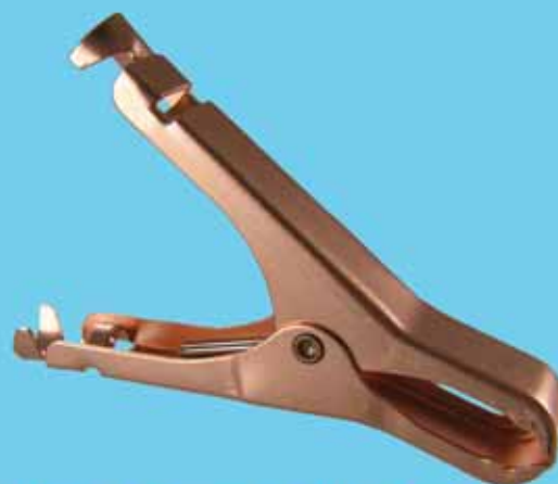
Small Charger Clip, Steel, Copper Plated, 50 Amp