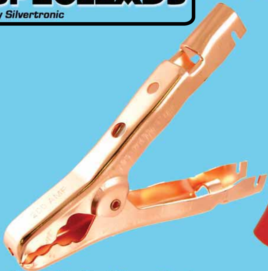
Large Charger Clip, Steel, Copper Plated, 200 Amp