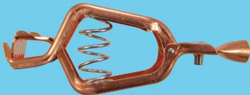
Clip, Solid Copper, 100 Amp