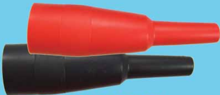
Insulator for 501996 Series