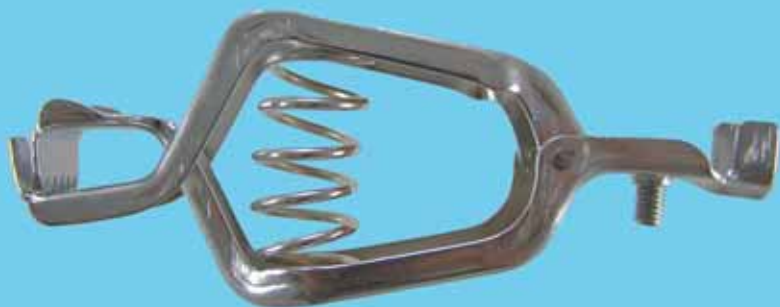
Clip, Steel, 50 Amp