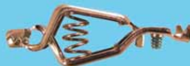
Analyzer Clip, Solid Copper, 20 Amp