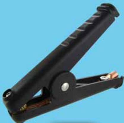
Fully Insulated Heavy Duty Clamp with Solid Copper Pads, 500 Amp