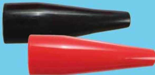
Insulator for 501797 Series