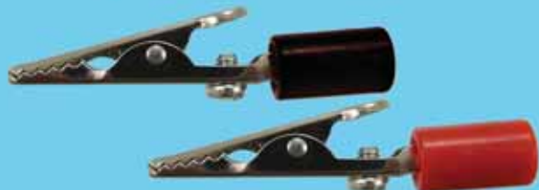
Alligator Clip, Steel, with Barrel, Screw & Handle, 10 Amp