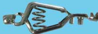
Analyzer Clip, Steel, 10 Amp