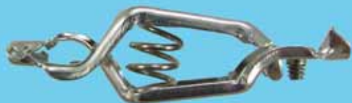
General Purpose Test Clip, Steel, 20 Amp