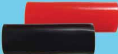
Insulator for the 501774 Series, {2 Req'd per clip}