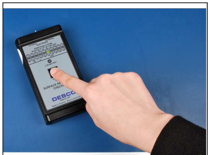
Figure 3. Using the internal parallel electrodes to measure surface resistance

Note: For worksurfaces, use Desco Item# 10435 Reztore™ Antistatic Surface and Mat Cleaner or other silicone-free ESD cleaner. Be sure the surface is dry before testing.