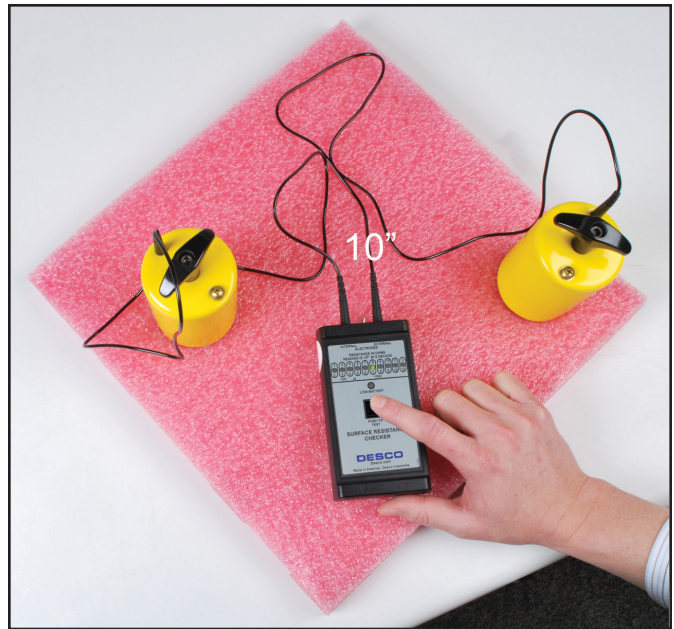
Figure 4. Using the test leads and two 5 pound electrodes to measure RTT