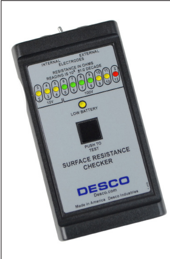
Figure 1. Desco 19640 Surface Resistance Checker