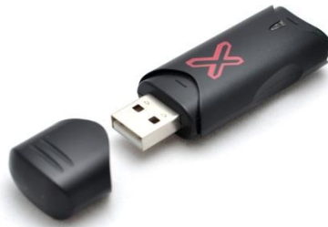
Figure 5.1 FT-X-GPS Dongle

The module has a type A USB connector with dust cap for connecting to the USB host and will be powered from the USB host.