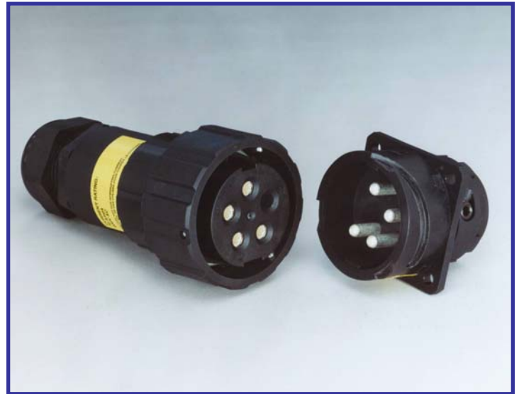
Amphe-GTR – 4 Conductor

Technical Specifications: Connectors are listed to UL/CUL 2238 Standard, Control Number 19VP. The Amphe-GTR connectors utilize a standard PG adaptor watertight strain relief on the plug to achieve their IP67 seal rating. Size 4 RADSOK Contacts are individually rated to 120 Amperes continuous. Connector assemblies are current rated per the cross-reference table above. Insulation Resistance is rated at 1000 MΩ and Dielectric Withstanding Voltage is rated at 2000 V AC (RMS). The Composite GT is flammability rated to UL94V-0.