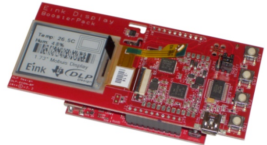
Shown here with the TI G2 LaunchPad (Sold Separately)