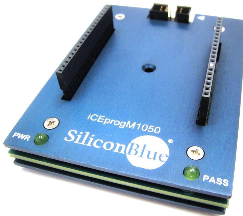
Figure 1: iCEprogM1050-01