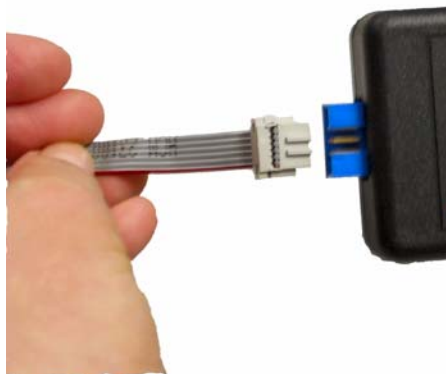
Figure 2. Connecting the Six-Conductor Ribbon Cable to the Serial or USB Smart Cable

After installing the USB Smart Cable, connect the power supply to the development board at connector J7, and then to an electrical outlet. The Green 3.3 V DC LED illuminates indicating that power is supplied to the board.