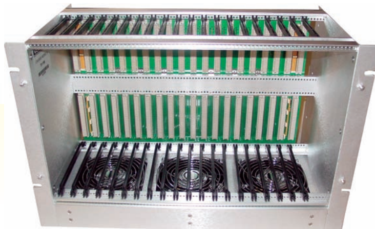
VectorPak™ powered subrack with VME J1/J2 backplane and integrated fans