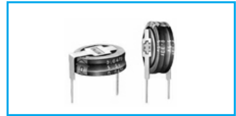
Marking color : White print on an indigo sleeve