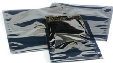
3M™ Static Shielding Bag 1900 and 1910

These bags are tested to meet or exceed certain electrical and physical requirements of Static Shielding Bags, ANSI/ESD S541, and to be ANSI/ESD S20.20 program compliant. Bags are RoHS Compliant* and lead-free**.