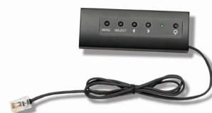
Optional Remote On-screen Display Module (Part number: 30114)