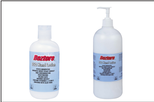
Figure 1. Reztore™ ESD Hand Lotion.