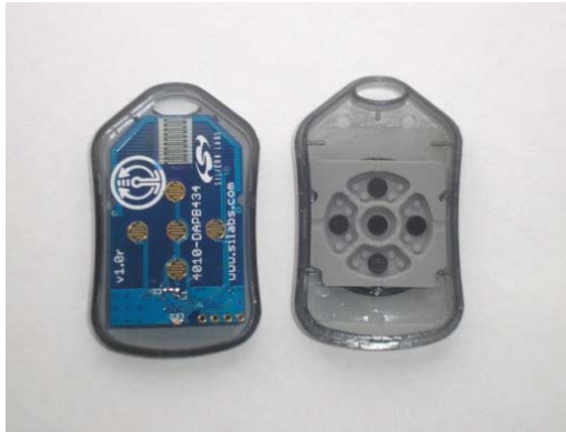
Figure 1. 4010 RKE Universal Key Fob and Plastic Case (P/N 4010-DAPB_434 and MSC-PLPB_1)