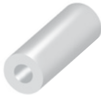
R30-500 Brass, Circular M3, Ø4.76mm O/D