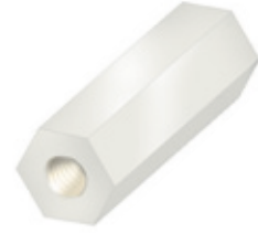
R30-161 Plastic, Hexagonal M3, 5.5mm A/F