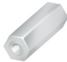
R30-101 Brass, Hexagonal M3, 5.5mm A/F