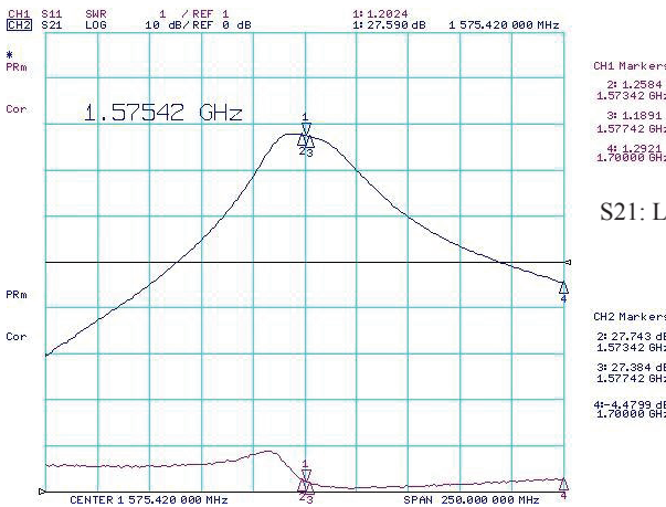
S21: LNA Gain