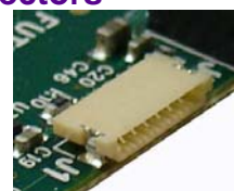
6-pin 1mm Header Mini-ISP