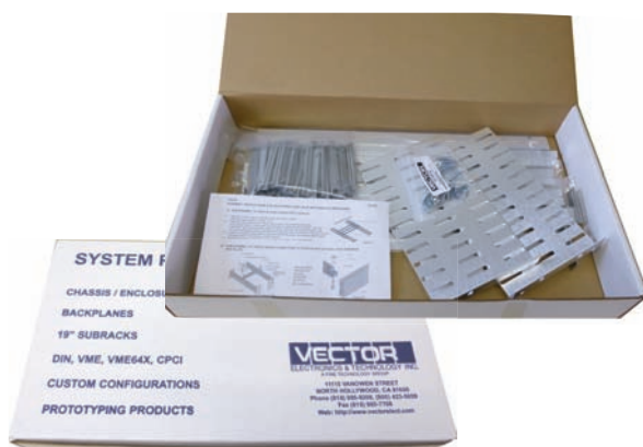
Subrack Kits (CCK)

New Item: CCK19F/90 (For max 11.5" x 13.5" cards)