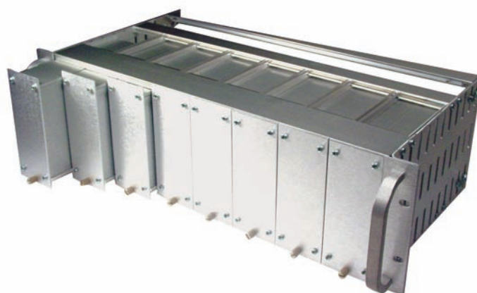
Assembled Module Subracks (CMA)