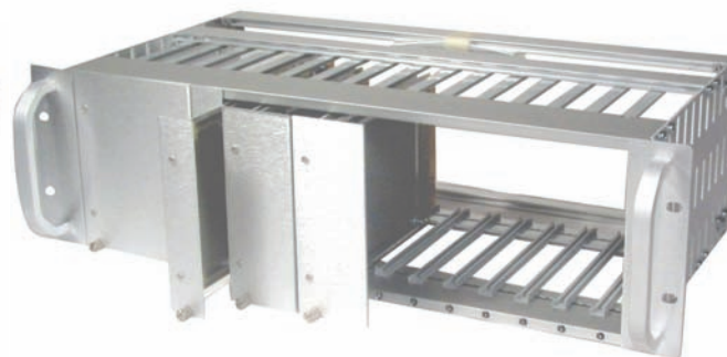
Assembled Card Mount Subracks (CCM)