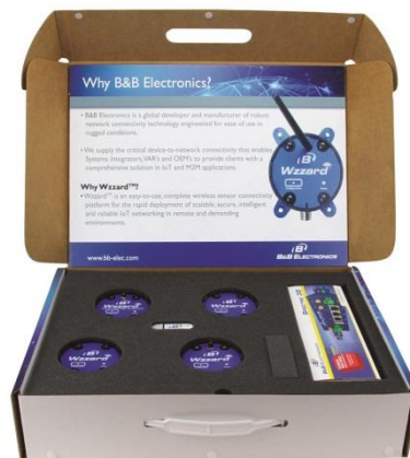
Figure 2. Package Contents

The Wzzard Design and Development Kits come in an enclosure. The contents of the package are shown below: