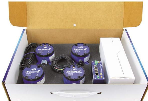
Figure 3. Repackaging the Development Kit

The package allows you to repackage the contents. By simply removing the middle foam section and removing the foam inserts, Nodes and Gateways can be easily repackaged. Accessories can be placed within the Gateway box. See below: