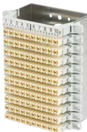
3M™ High Density Cross-Connect Module STG2000 in a 100-pair block configuration

The 3M STG2000 modules feature 3M IDC technology which offers reliable performance for mechanical wire retention, multiple re-terminations, and environmental protection to gas-tight connection. The modules can connect solid copper conductors in a range of diameters from 26 (0.4 mm) to 20 AWG (0.8 mm) with a maximum insulation sheath of 15 AWG (1.5 mm).