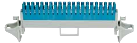
3M™ Switching Module STG2 O2