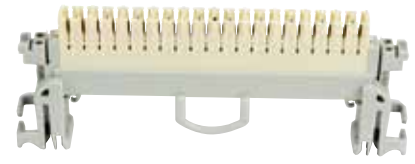
3M™ Disconnection Module STG2 C2

In the critical NEXT (near-end cross-talk) measurement, the 3M STG2000 module typically exceeds -52 dB (decibels) at 30MHz. This equates to high bandwidth now, and reserve bandwidth for future upgrades. The 3M STG2000 module can handle VDSL2 bit rates, enabling service providers to support their customer requirements for high speed applications and quality of service.