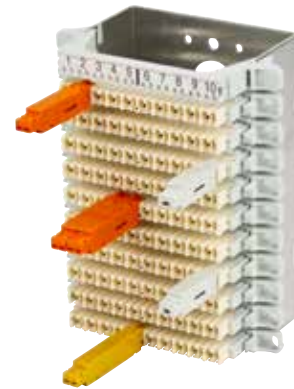
3M™ High Density Cross-Connect Module STG2000 100-pair block with single pair protectors