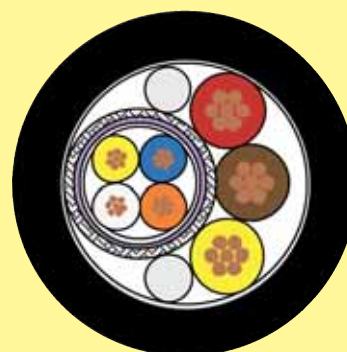
Structure Hybride cable