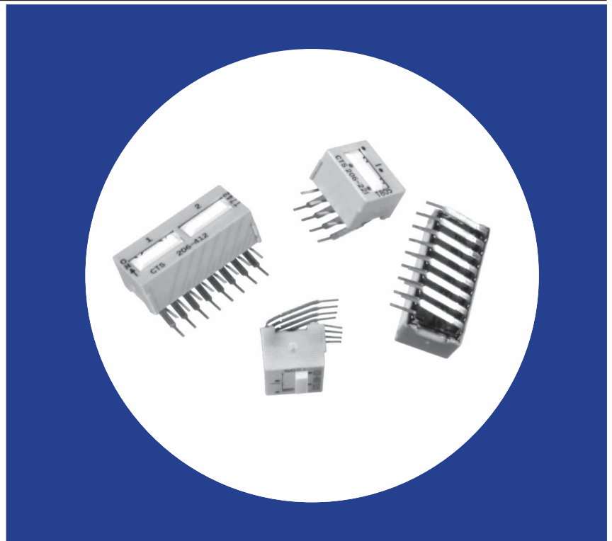
Series 206RA – Premium Gold Plated Contacts Series 208RA – Economical Tin Plated Contacts