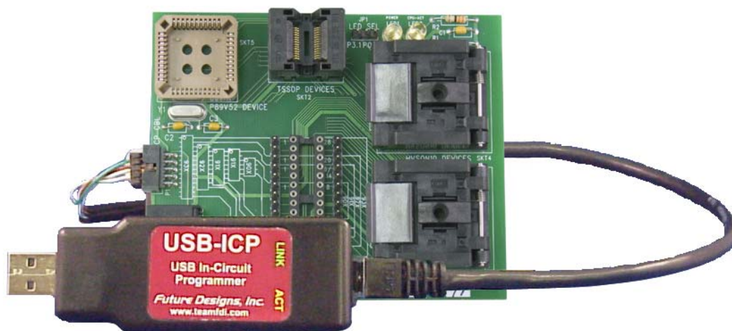
USB-ICP-SAB9 shown with USB-ICP-LPC9xx (USB-ICP-LPC9xx Sold Separately)