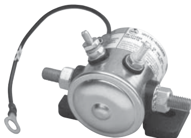
Type 70 SPNO