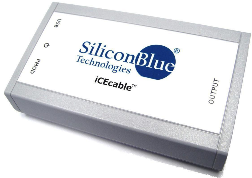
Figure 1: iCEcableM100-01