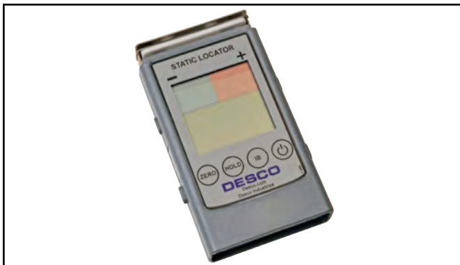
Figure 1. Digital Static Locator Item # 19430