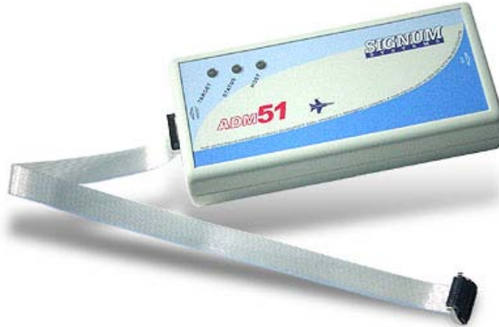
Figure 2: Signum ADM51 Emulator Pod

Note: Since meters are sometimes tested with live voltages, isolation of the emulator is strongly recommended. USB isolators are available from various vendors. For example, the UIISOHUB4 or UEF10M are available at B&B Electronics ( www.bb-elec.com , or http://www.bb-europe.com/ ).