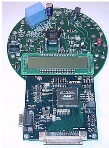
Figure 5: 71M6513 Demo Board with Debug Board

After the evaluation phase, the Demo Board can serve as a platform for code development, which can be done simultaneously with schematic design and layout.