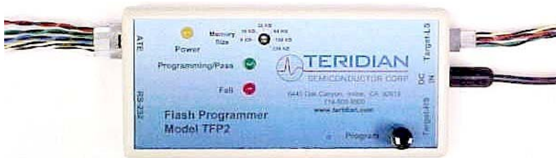
Figure 4: Teridian TFP-2 Flash Programmer

The Signum ADM51 can serve as a programmer for prototyping and small quantities. For programming production quantities, Teridian offers the TFP2 Flash Programming Module (P/N 80515-FPBM-TFP2), which is a stand-alone programmer that can be operated manually or in an ATE environment (see Figure 4).