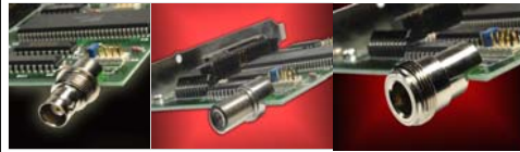
Patented V-Bite®, Snaps Into PCB, Surface Mount Center Contact