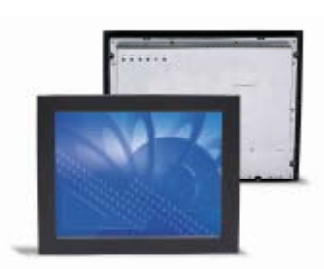
Contour Flanged Bezel Option

(Part number: 29369) 377.8 x 301.8 mm 14.87 x 11.88 inches