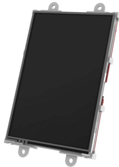
The uLCD-35DT Display Module

NOTE (*): Arduino remains the property of the Arduino Team. All references to the word Arduino and Arduino Hardware are licensed under the Creative Commons Attribution Share-Alike license.