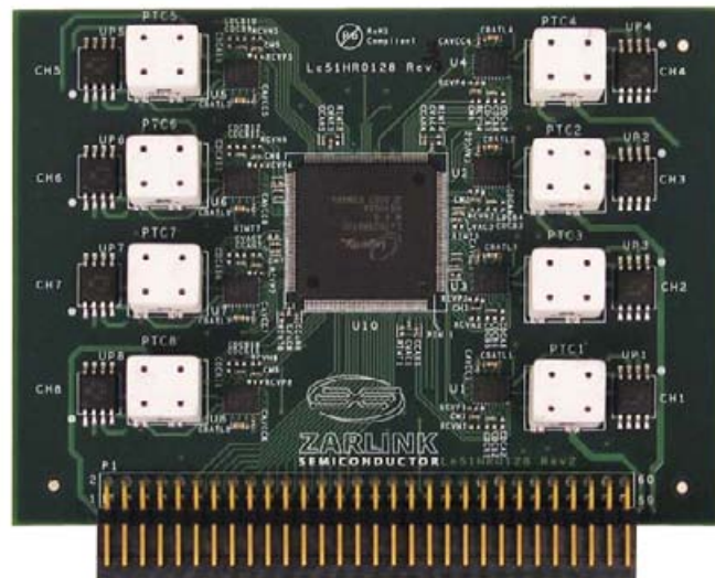
Le51HR0128 VCP Octal ISLAC Line Module

Our VoicePath™ Application Programming Interface II (VP API-II) provides a standard software interface for controlling, supervising, and performing line testing using VE792 NGCC voice termination devices.