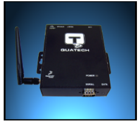
Quatech wireless (802.11b) device servers are available in 1 or 2-port configurations.

When you need the ultimate in wireless device server performance, ease of use and flexibility, specify Quatech.