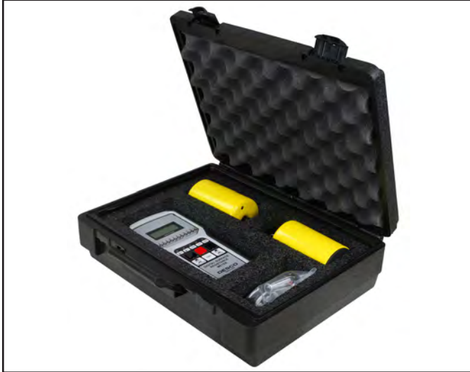
Figure 2. Desco 19787 Digital Surface Resistance Meter Kit