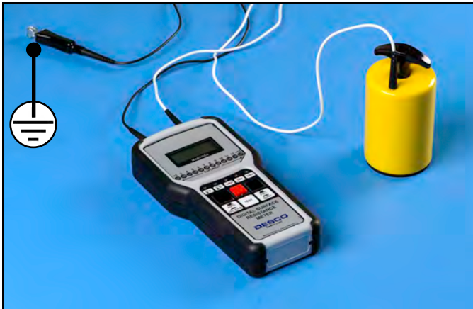
Figure 5. Rtg test setup

If the measurement is outside acceptable limits, clean the surface with an ESD cleaner containing no insulative silicone such as Reztore™ Antistatic Surface & Mat Cleaner , and re-test to determine if the cause of failure is an insulative dirt layer or the ESD worksurface material.