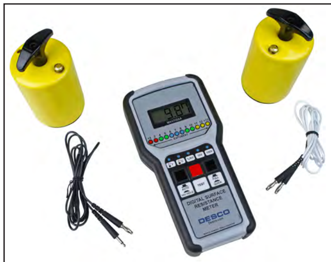
Figure 1. Desco Digital Surface Resistance Meter Kit