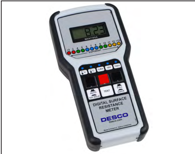
Figure 3. Desco 19788 Digital Surface Resistance Meter