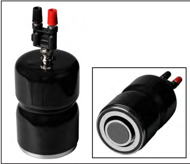
Figure 7. Desco 50005 Concentric Ring Probe

The Desco 50005 Concentric Ring Probe is an instrument to be used in conjunction with a resistance meter, such as the Desco 19787 Digital Surface Resistance Meter, to measure surface resistance per ANSI/ESD STM11.11 the test method listed in Packaging standard ANSI/ESD S541 for surface resistance of planar materials.