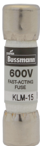
600Vac/dc 1 to 30A