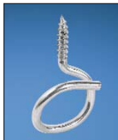
Wood Screw Thread