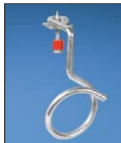
Power Actuated Fastener