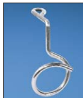
User Supplied Nail or Fastener