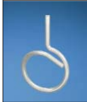
Non-Threaded #8 Wire