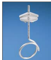
Integrated Toggle Screw