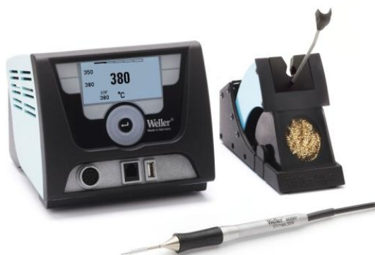
WX 1 control unit with WXMP Micro soldering pencil (40W / 12V) and WDH 50 safety rest