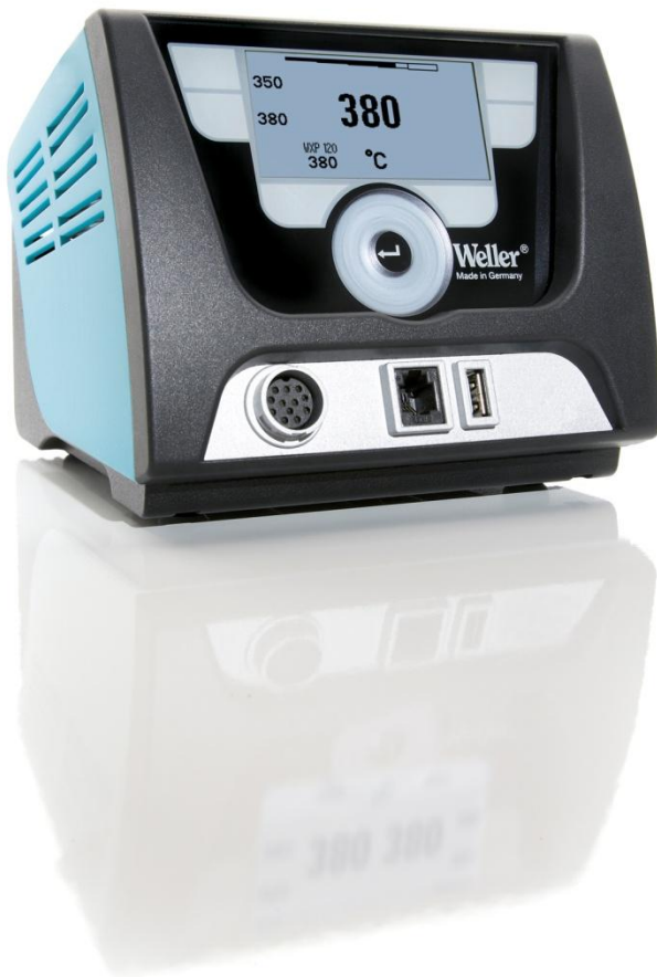
WX 2 control unit shown here

The new WX 1 control unit from Weller. A new era in soldering.