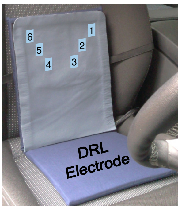
Figure 2 – Showing locations of the 6 sensors and the DRL fabric electrode

The pad also contains a piece of conductive fabric, concealed under the cotton cover on the seat base, which serves as the electrode for the driven ground plane. It should be connected to a Driven Right Leg (DRL) circuit such as the one contained within the PS25006 box, for noise cancellation.