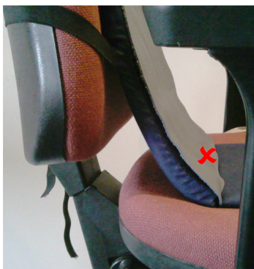
Figure 4 – Incorrect positioning of the seat pad.

The pad must not be placed as shown in figure 4, as the sensors will not be in the correct position and will not make good contact to the occupant's back: