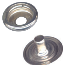
3M™ Female Snap SNAPSOCKET3/8 and 3M™ Female Snap and Eyelet 3034

Socket snaps are held in place by crimping the tip of an eyelet through the center of the socket with a snap tool. This traps the mat between the socket on the top of the mat and the eyelet on the back of the mat. 10 sockets and eyelets are included in each pack.