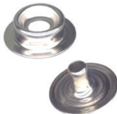
3M™ Male Snap SNAPSTUD3/8 and 3M™ Male Snap and Eyelet 3033

Stud snaps are held in place by crimping the tip of an eyelet through the center of the stud with a snap tool. This traps the mat between the stud on the top of the mat and the eyelet on the back of the mat. 10 studs and eyelets are included in each pack.