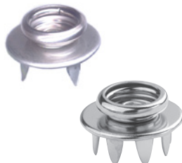
3M™ Female 4-Prong Snap FPSNAP and 3M™ Female 8-Prong Snap 3050

Prong Clinch snaps are held in place by pushing the prongs through the mat and crimping them on the bottom of the mat.