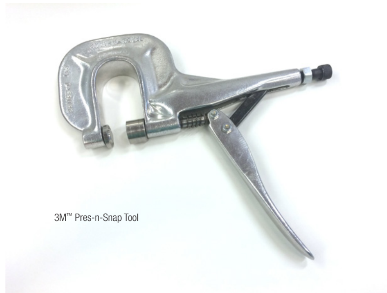
3M™ Pres-n-Snap Tool