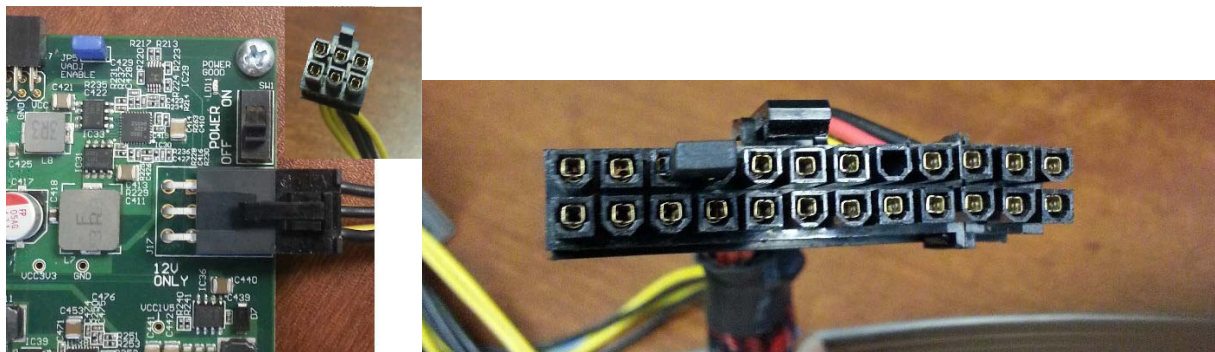
Figure1. Left: NetFPGA-1G can be powered by plugging the 6-pin PCIe power connector in J17; Right: Pin 16 and 17 are shorted using a jumper to power on a standard ATX power supply when used standalone.

The NetFPGA-1G can be powered using the 6-pin PCIe power supply connector (Fig. 1) of any standard ATX power supply. When installed on a PC motherboard, you can directly plug the 6-pin PCIe power supply connector of your PC power supply into J17. When used standalone (without a motherboard), you need to short pins 15 and 16 (pulling down PS_ON signal) of the main 20-pin connector of the standard ATX power supply to power-on the ATX unit (Fig.1).