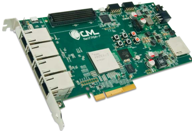
The NetFPGA-1G-CML board.

The NetFPGA-1G-CML is a versatile, low-cost network hardware development platform featuring a Xilinx® Kintex®-7 XC7K325T FPGA and includes four Ethernet interfaces capable of negotiating up to 1 GB/s connections. 512 MB of 800 MHz DDR3 can support high-throughput packet buffering while 4.5 MB of QDRII+ can maintain low-latency access to high demand data, like routing tables. Rapid boot configuration is supported by a 128 MB BPI Flash, which is also available for non-volatile storage applications. The standard PCIe form factor supports high speed x4 Gen 2 interfacing. The FMC carrier connector provides a convenient expansion interface for extending card functionality via Select I/O and GTX serial interfaces. The FMC connector can support SATA-II data rates for network storage applications. The FMC connector can also be used to extend functionality via a wide variety of other cards designed for communication, measurement, and control.