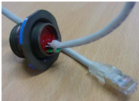
RJF TV 7SA2 G 05 100BTX