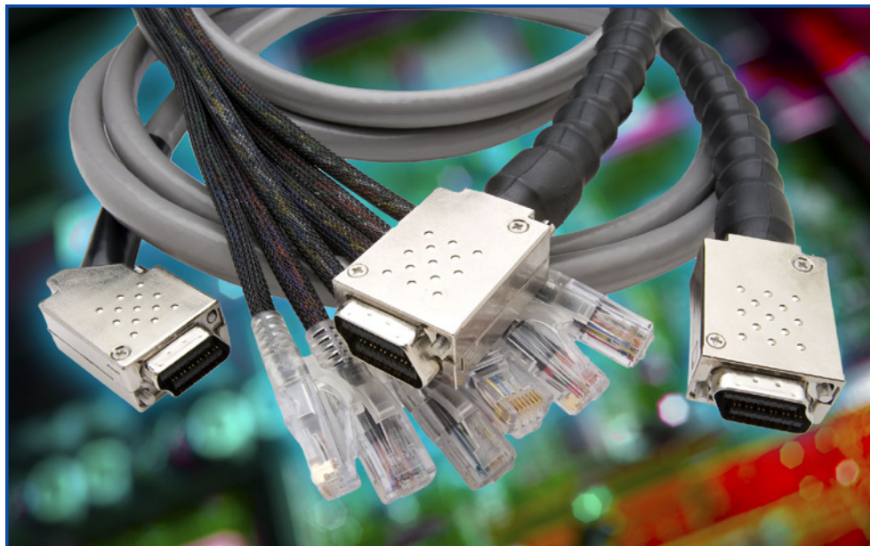
MRJ21 cable assemblies showing connector options: MRJ21 180 degree straight and 45 degree angle connectors as well as multiple RJ45 connectors.