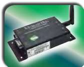
XTend ® PKG