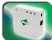
XBee ® Gateways