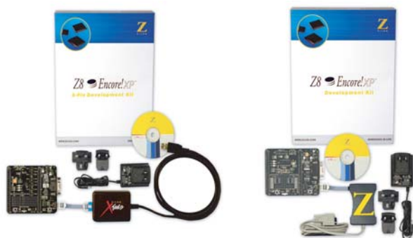
20, 28-Pin Development Kit