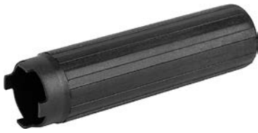
MSM 16 Installation Wrench