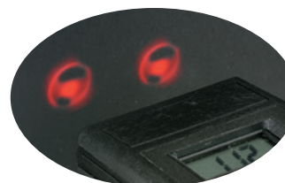
3M™ Static Sensor 718 Range Finder Unfocused