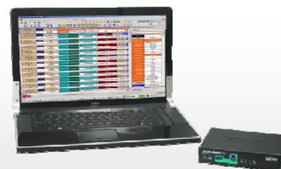
Compact size of Advisor T3 allows for easy portability

The Advisor T3 Basic model is the industry's lowest priced USB 3.0 analyzer. The Advisor T3 Standard Edition adds more capable triggering for 2.0/3.0. The Standard model is also available in a USB 2.0 only configuration that is upgradeable to 3.0. For SuperSpeed power users, the Pro upgrade option brings advanced triggering, real-time metrics and other Voyager Pro software features to the Advisor T3 Standard model.